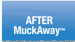
AFTER MuckAway ™