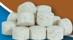
Precision Release Pellets